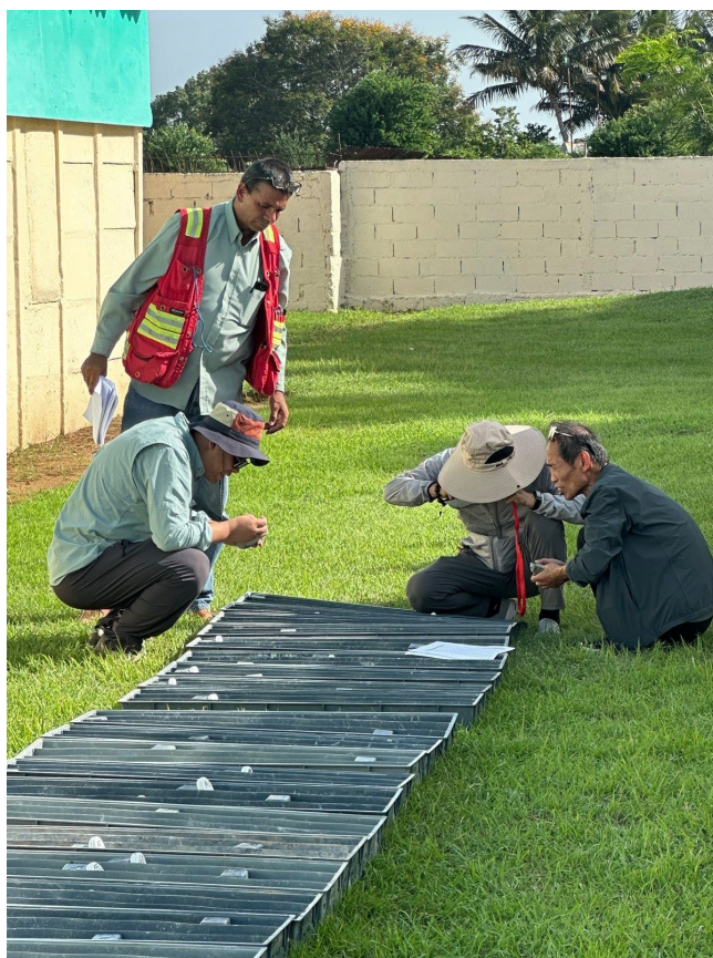
Xinhai Mining geologists examining Nueva Sabana drill core during project due diligence program