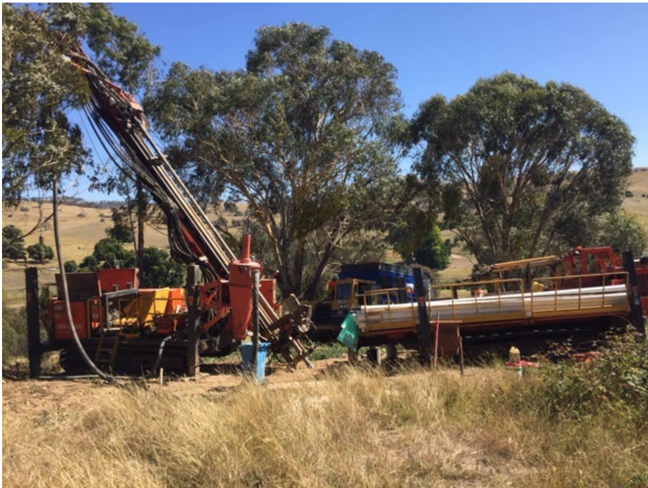
Figure 1: March 2023 Drilling Campaign (3DGIB016)

Additional drilling is also planned to explore the western extensions to the O'Brien Workings that may offer similar targets to the recent discovery west of the Perkin's Workings. In April 1998 a line of drill holes tested for western extensions to these workings approximately 50 Metres west of the past workings. This drilling had identified at least 3 mineralised structures extending beyond these workings. While grades in this historical drilling had not been commercial, the strong alteration seen in these holes would suggest that mineralisation similar to that Perkin's, may also be possible west of these past drill holes.