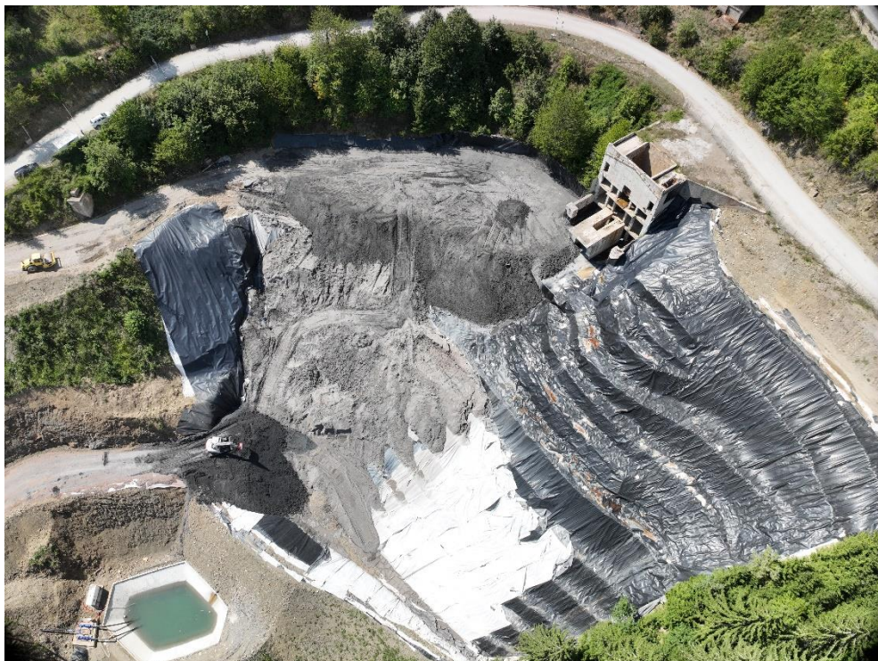
Figure 3: Temporary Tailings Storage Facility at VPP

The current operating temporary TSF at the Vares Processing Plant has a maximum capacity of approximately 133,000t, which on current projections will allow tailings deposition into mid-Q1 2025. Therefore, as Adriatic aims for construction of the Veovaca TSF to be completed by the end of 2024 there will be no impact on production or the current ramp up to commercial production due to tailings storage capacity.