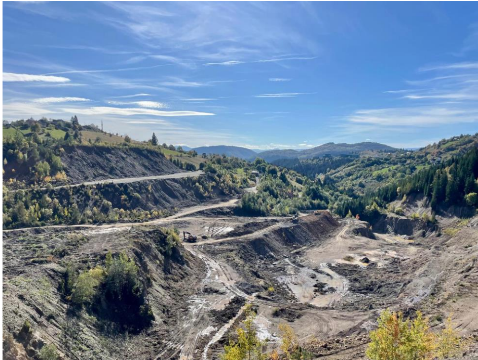
Figure 4: Veovaca Tailings Storage Facility