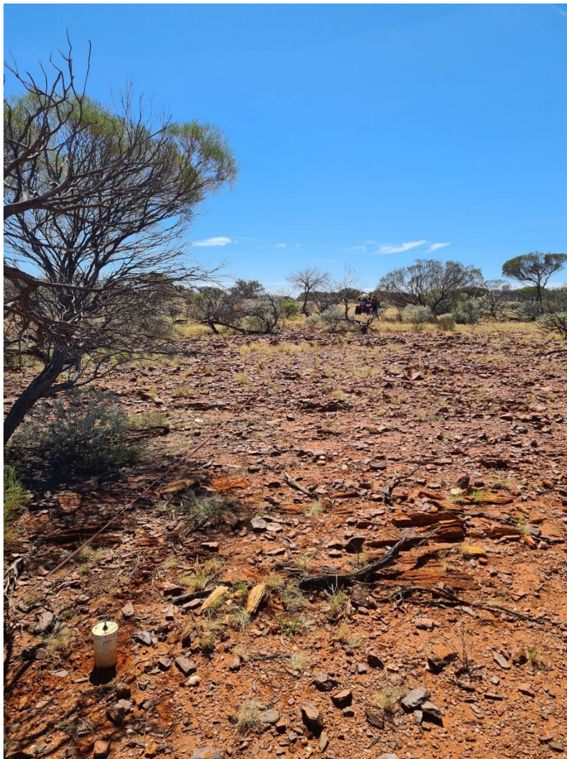
Figure 2: Photograph of Khumsup Geophysics personnel laying cable and from the installed electrode required for the GAIP process

The GAIP survey (Figure 2) is being conducted by experienced geophysics contractors from Khumsup Pty Ltd across the Ives Find and Barwidgee Fault prospects (Figure 1). GAIP surveys produce detailed images of chargeability and resistivity that can give indications of disseminated sulphide and silicification, as well as quartz veins respectively. Both of which are known to be associated with gold on the project.