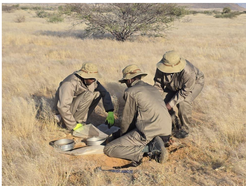
Image 3: Sampling team in the field at EPL 7626 recording the location of the sample and the sample ID for preparation and analysis.

Sample preparation will be conducted on-site, including dry sieving to obtain an optimal particle size distribution (PSD) for geochemical analysis. The resulting samples will be pressed into pellets and analysed using Askari's in-house LIBS (Laser-Induced Breakdown Spectroscopy) system to screen for geochemical anomalies and identify priority areas for infill sampling.