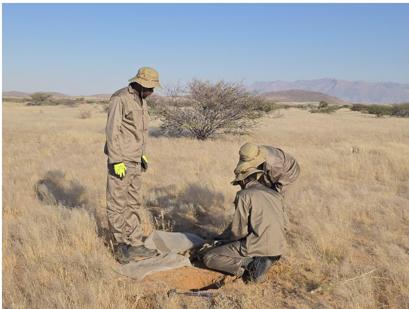
Image 1: Sampling team in the field at EPL 7626 collecting sieved soil samples.

The images below illustrate the sampling team in the field on EPL 7626.