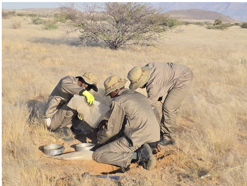
Image 2: Sampling team in the field at EPL 7626 weighing sieved soil samples in preparation for bagging the samples for analysis with XRF, LIB's and Pellet Press.