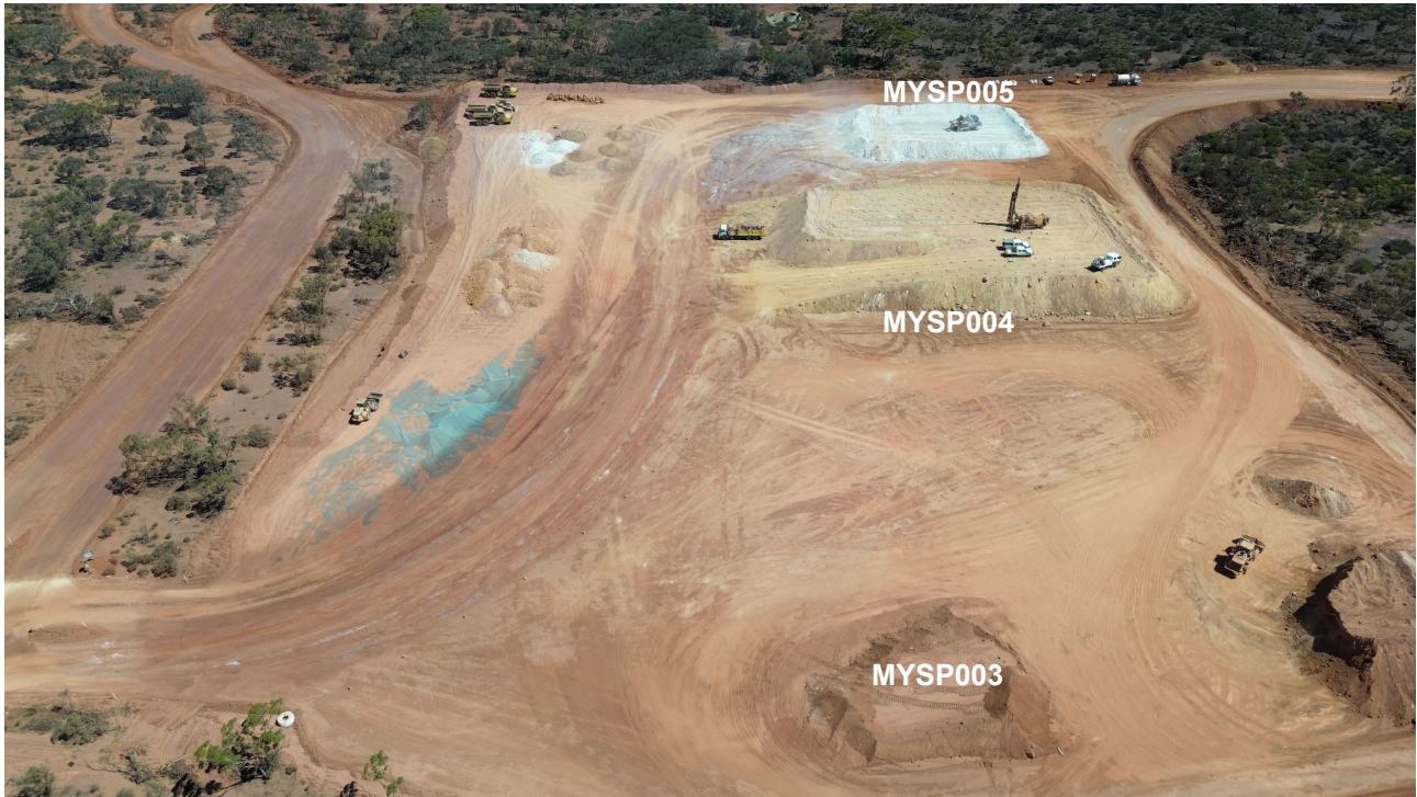
Figure 2: Myhree ROM pad showing stockpile MYSP003 with haulage >50% complete, MYSP004 undergoing grade determination activities and MYSP005 under construction

Myhree has produced ~110kt of Ore to 31 October 2024 with grade reconciliation to the block model as expected at this stage of the pit. Three dig fleets are operating with drill and blast now underway.