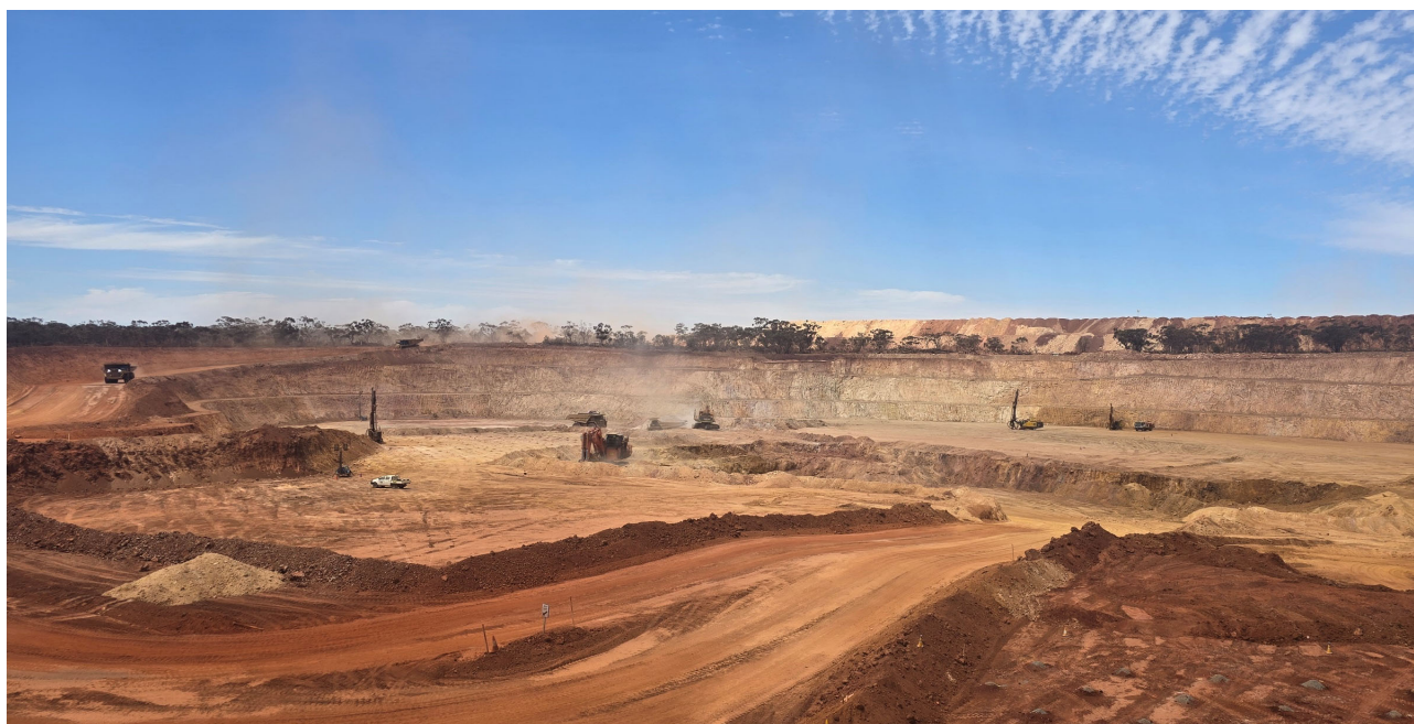
Figure 1: Myhree open pit (looking north) with multiple dig fleets and drill and blast activities

Black Cat’s Managing Director, Gareth Solly, said: “ Excellent progress is being made at Myhree/Boundary with accelerated mining delivering ~110kt of Ore, well ahead of schedule. Expedited cashflow from Myhree/Boundary will complement the recent $80M placement and underpin Black Cat producing more gold, sooner from multiple operations. ”