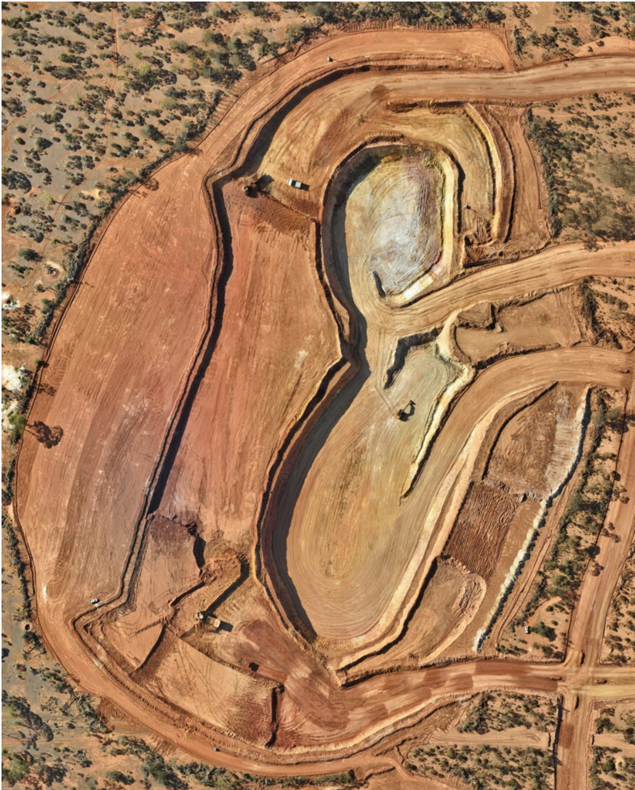
Figure 3: Aerial view of the Myhree open pit (north top of page)