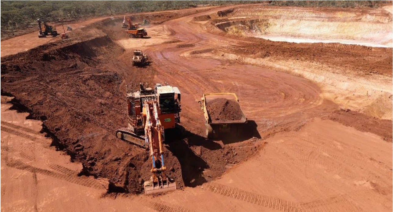
Figure 2: 200t excavator now on site and prioritising bulk waste movement in the Myhree open pit

Myhree produced ~78kt of Ore for the quarter with grade reconciliation to the block model as expected at this stage of the pit. Ore mining and a 24-hour free-dig operation is underway at Myhree/Boundary with ~78kt of Ore mined between 26 July and 30 September 2024.