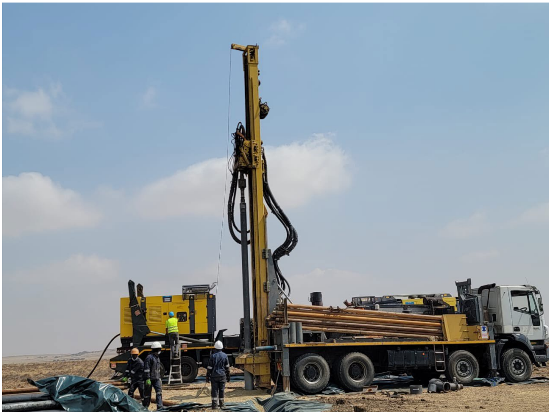
Commencement of drilling at RBD12

D3 Energy Limited ( ASX:D3E ) ( D3 Energy or the Company ) is pleased to announce the successful spudding of the RBD12 well, located within the ER315 permit in the Free State, South Africa. This marks the next stage of the Company's ongoing exploration and appraisal programme aimed at unlocking the full potential of its helium and natural gas assets.