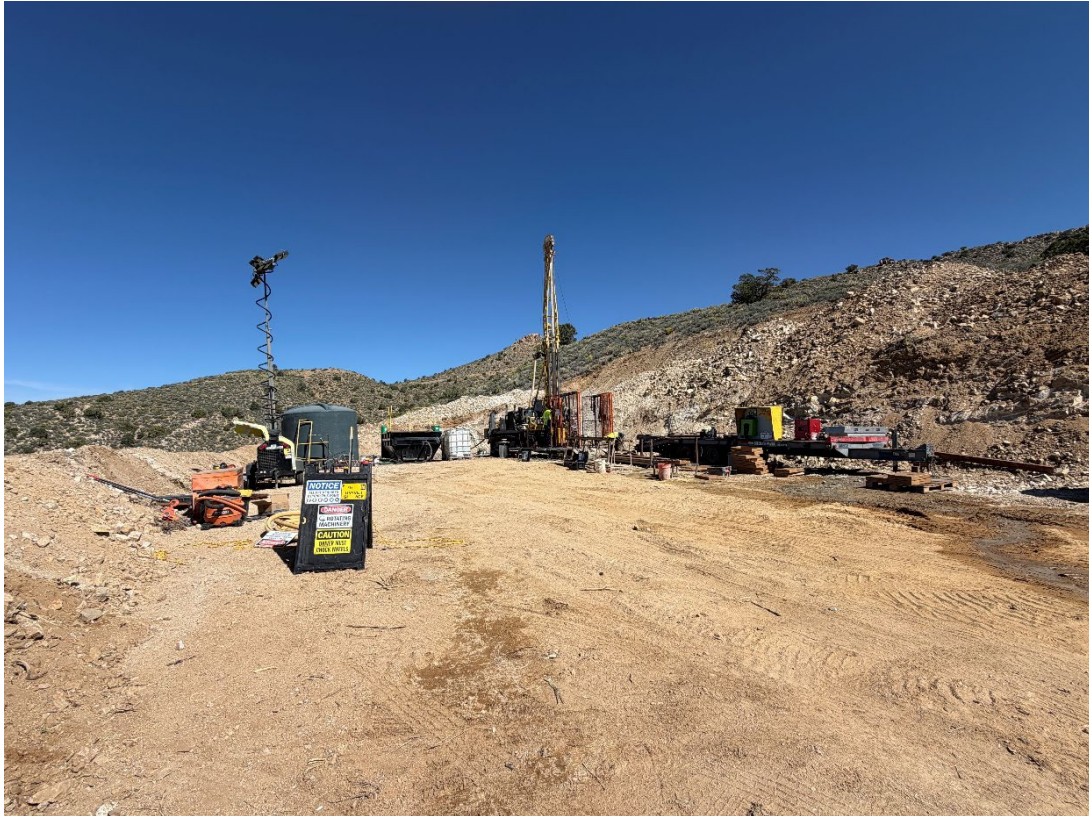
Figure 3: Dateline diamond drill rig testing the REE targets at Colosseum