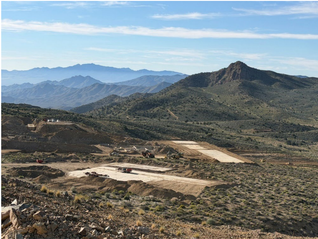
Figure 1: Equipment laydown area and other works at Colosseum