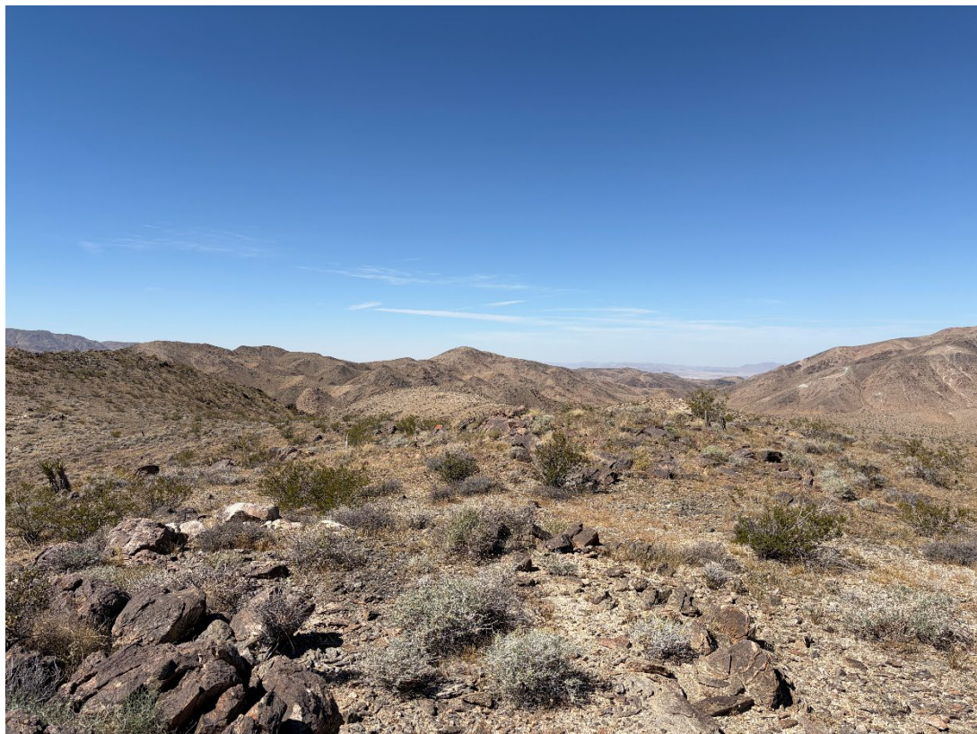
Figure 4: Music Valley – Photo taken looking north from southern end of project area during mapping program