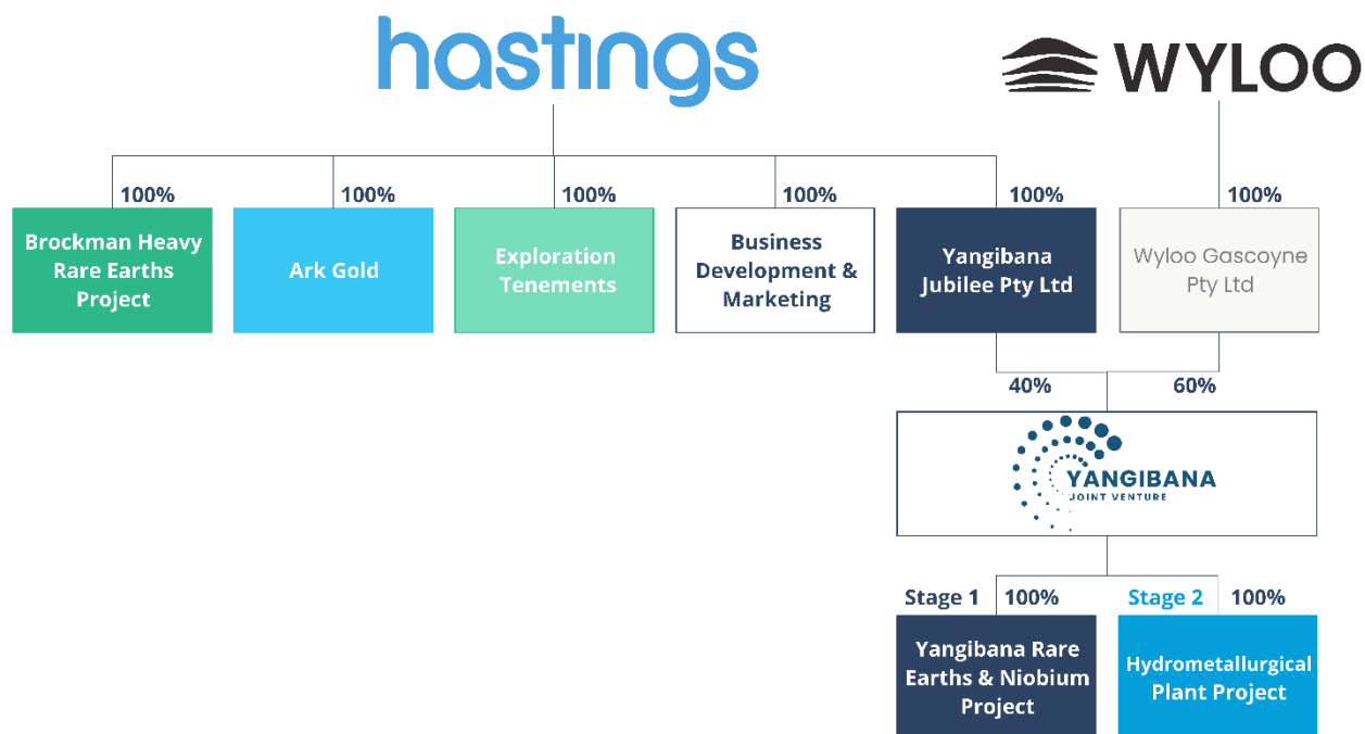
Figure 1: Group Structure