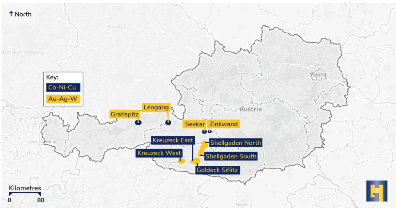
Figure 1. Location of High Grade Metals' Projects within Austria

High Grade Metals (ASX: HGM) is an Australian mineral exploration company with a portfolio of brown fields cobalt, copper and gold assets. The Company's major projects are all located in mining friendly Austria, which covers an area of about 84,000 km 2 across Central Europe. The highly experienced management aims to grow the value of HGM's project portfolio to benefit shareholders by leveraging innovation and maximizing value of the assets through systematic exploration and teamwork. The dynamic two-year exploration and development program underpins the Company's business strategy.