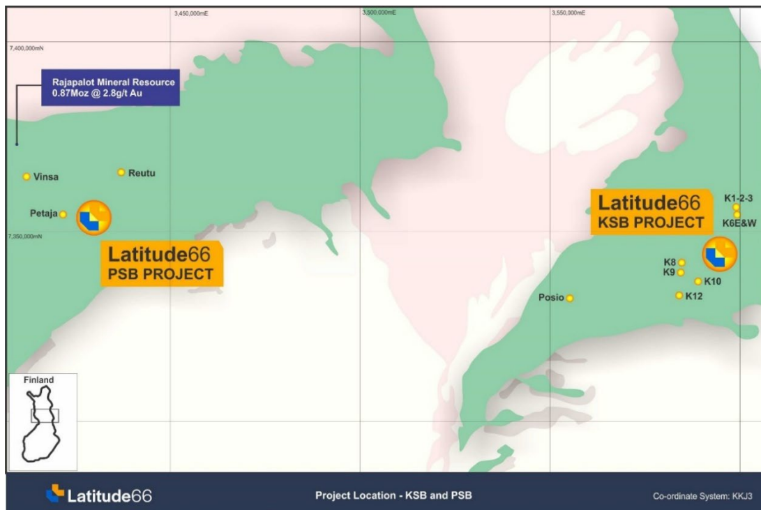
Figure 1: KSB & PSB Project locations in Northern Finland 1