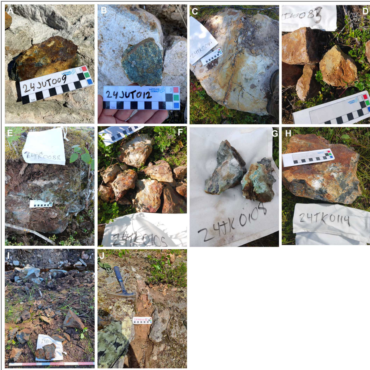
Figure 5: Significant boulder/rock chip samples from the Petaja Prospect.