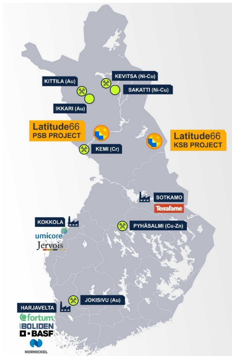
Figure 4: KSB & PSB Project location map

Additional mapping of the Vinsa quartz vein will be completed before the end of the summer field season, It is planned to follow up the mapping with an electromagnetic survey over the Vinsa and Petaja project areas.