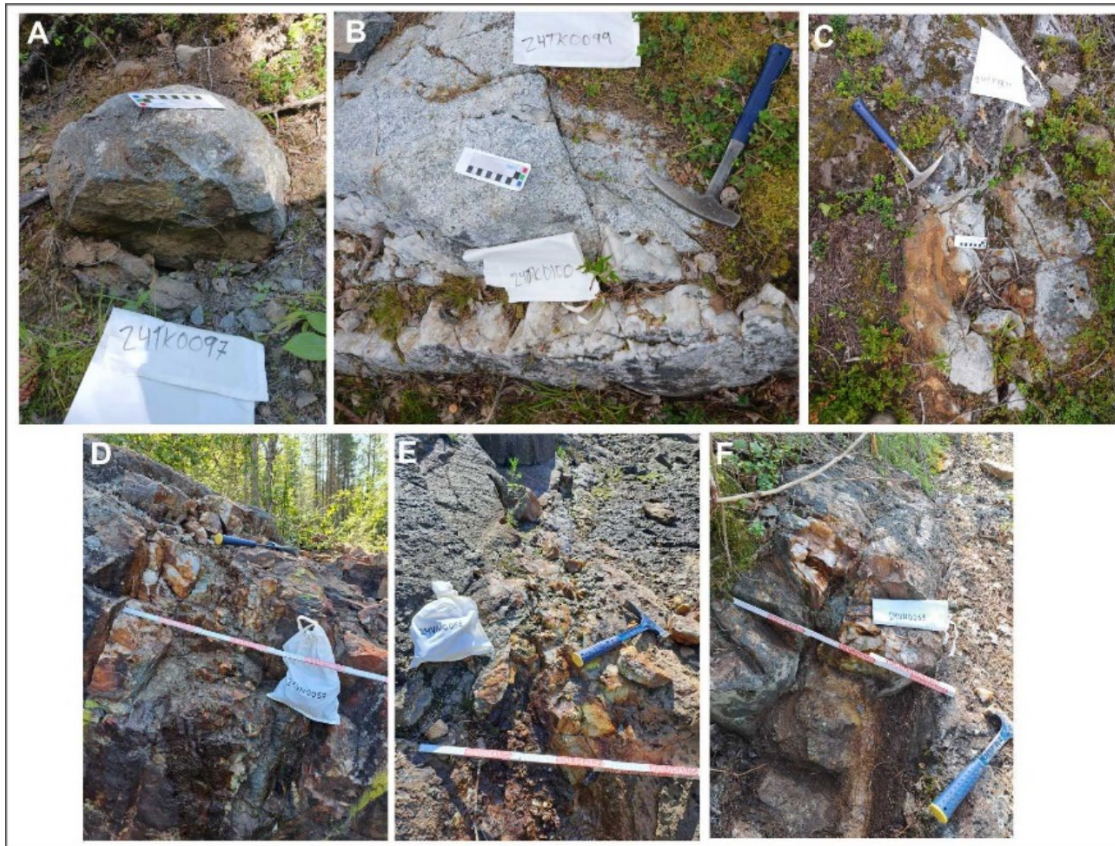
Figure 6: Significant boulder/rock chip samples from the Vinsa Prospect.