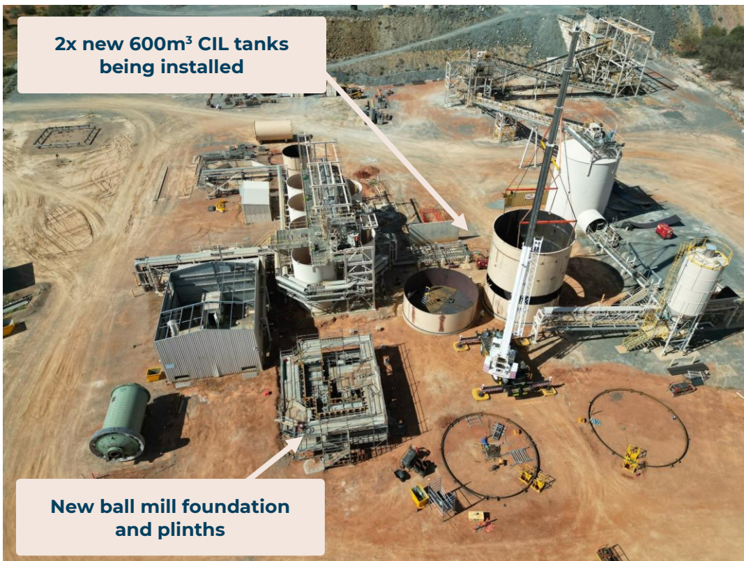
Figure 2: Drone image of the new ball mill foundation and plinths in the foreground and tank installation in the background, December 2024.