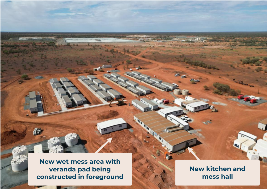
Figure 5: Accommodation village, December 2024.