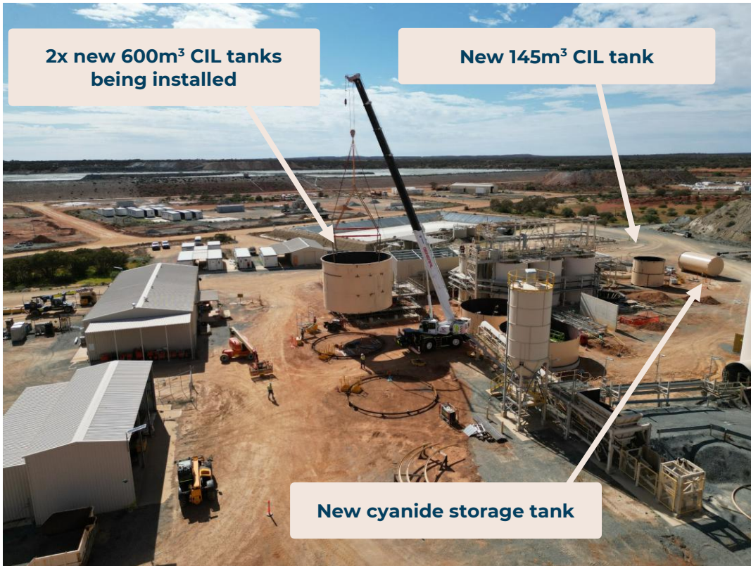
Figure 1: Drone image of the 2x new 600m 3 tanks being installed for the expanded CIL circuit, December 2024.

Meeka Metals Limited (“Meeka” or the “Company”) is pleased to provide a pictorial update of the continued progress made during December 2024.