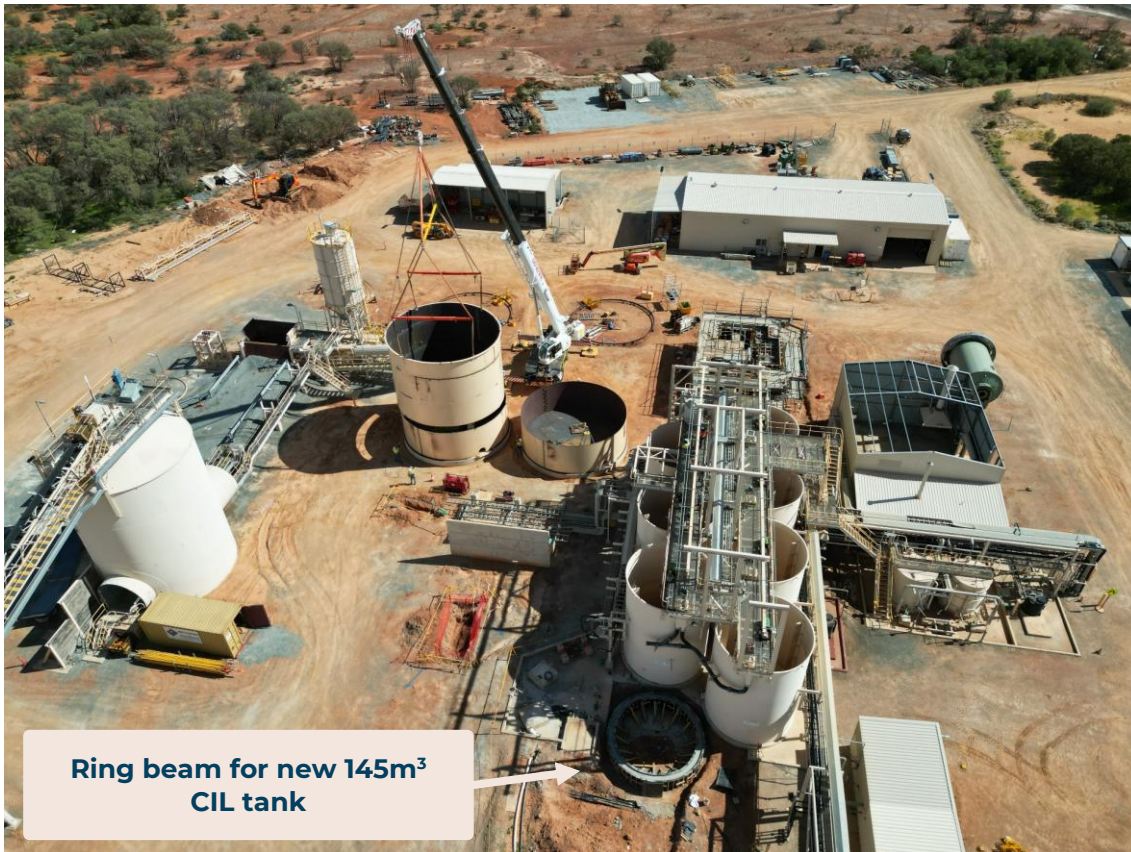
Figure 3: Drone image of tank installation, December 2024.