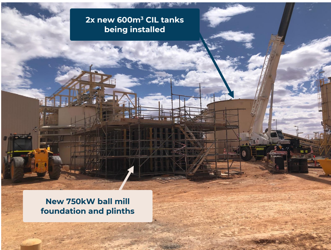
Figure 4: New ball mill foundation and plinths for larger 750kW ball mill, December 2024.