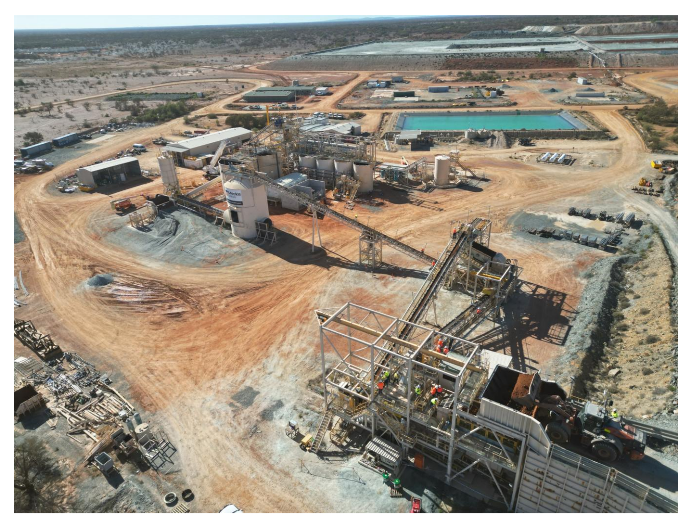
Figure 2: ROM loader feeding ore into the processing plant, 11 June 2025.