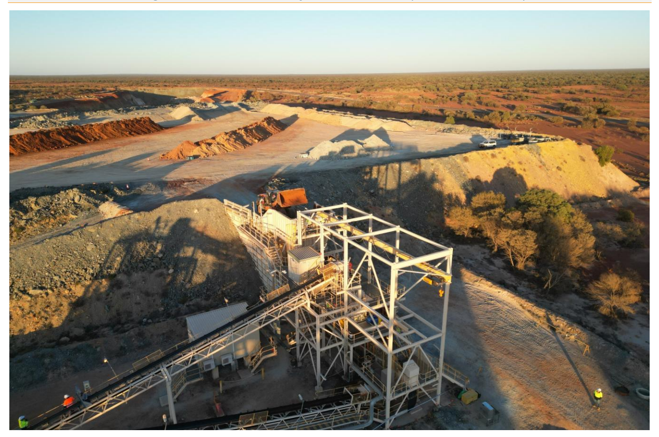
Figure 1: First ore being fed into the crusher, 11 June 2025.

We are now focussed on maximising the expanded open pit mining opportunity following the success we are having with the drill bit. Additionally, first ore is expected from our first underground mine at Andy Well in the September 2025 quarter."