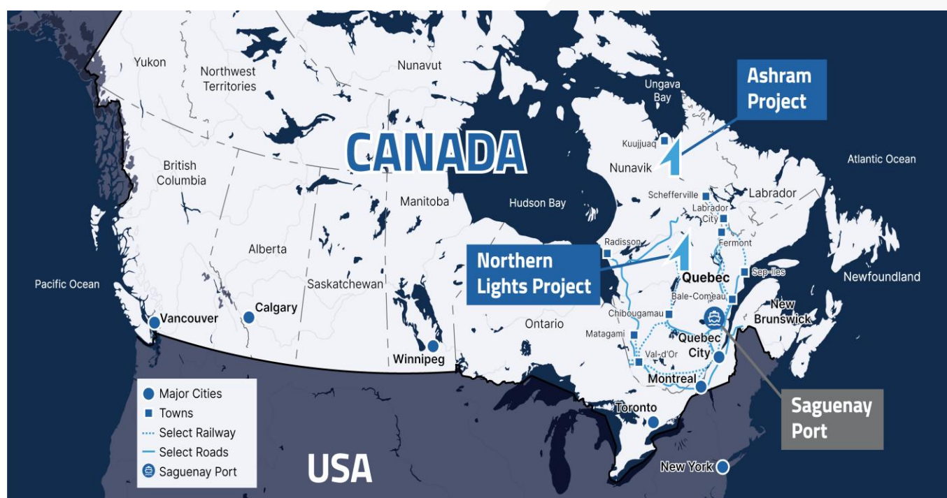
Figure 3 Location of the Ashram REE & Fluorspar Project, the Northern Lights Project and the Port of Saguenay

For further information regarding Mont Royal Resources Limited, please visit the ASX platform (ASX: MRZ) or Mont Royal's website www.montroyalres.com