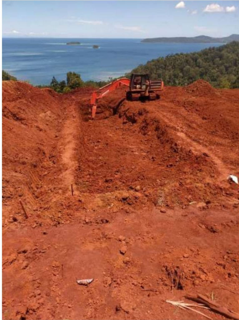
Figure 3 – Saprolite ore being dug for stockpile