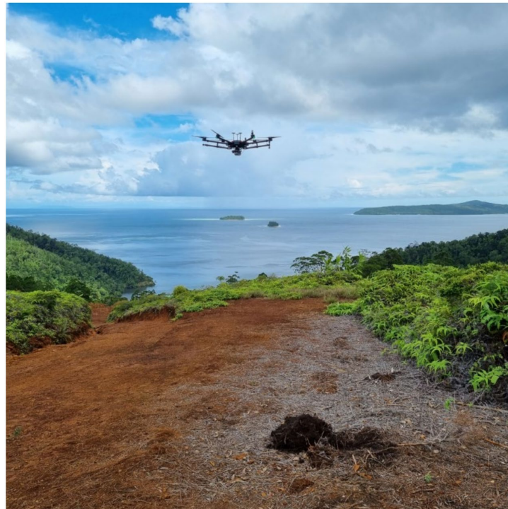
Figure 2 – LiDAR Drone Survey over the Kolosori Project

The Company has recently completed the remainder of the LiDAR survey over the total current mining area. The LiDAR survey provides a detailed topographical plan which is critical to the Reserve Estimate and the long-term mining plan.