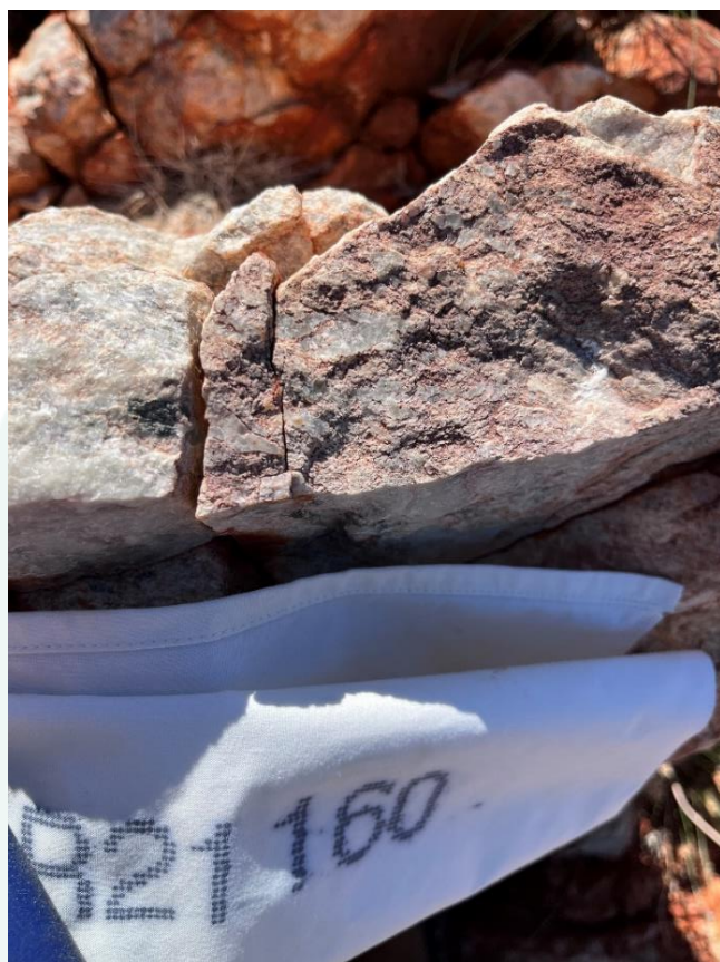
Figure 2: Rock sample R21160, collected from a 6-metre wide pegmatite outcrop

Management is currently planning a more detailed mapping and sampling campaign across the entire Roebourne project area. The scope of the planned program will include detailed mapping of outcropping pegmatites; rock sampling at a greater density; and detailed soil sampling over areas with sediment cover.