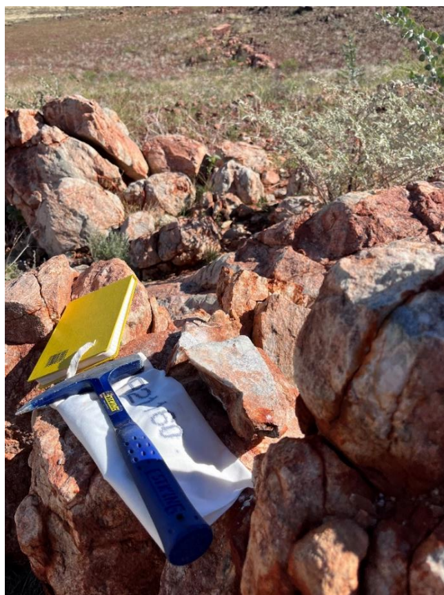
Figure 3: Pegmatite outcrop at rock sample R21160 location, with further pegmatite outcrops along strike (in background)