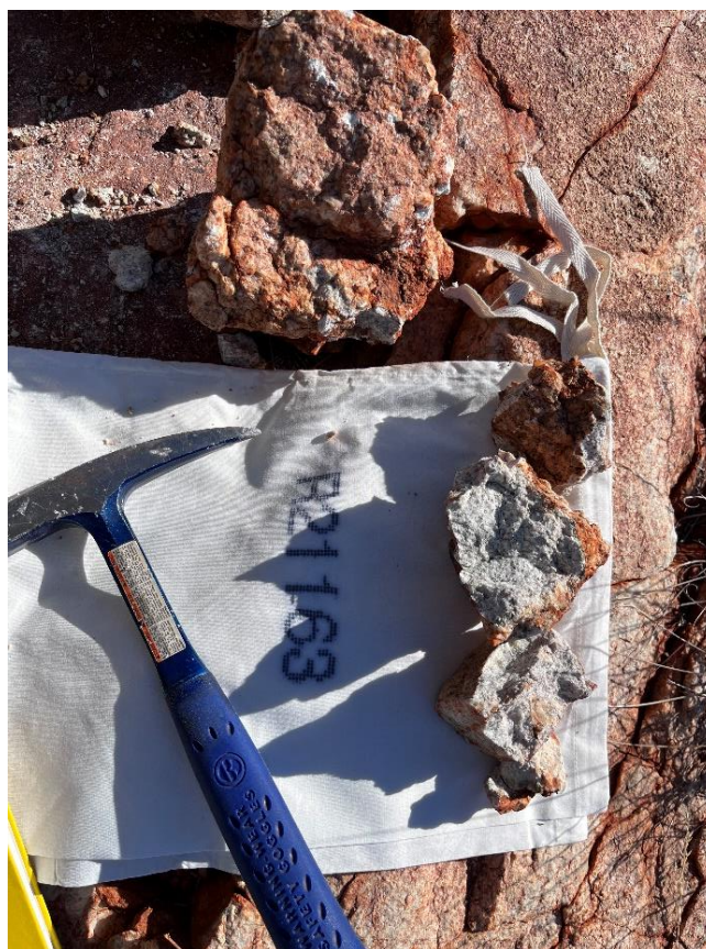
Figure 4: Rock sample R21163 on pegmatite outcrop

A broader exploration program, including mapping and sampling for lithium bearing pegmatites within the Company's Mt Sholl project area, adjacent to the recently announced discovery of high-grade lithium bearing pegmatites by GreenTech Metals Ltd (ASX: GRE) on the Ruth Well project 4,5 , is also in planning phases and will be undertaken in the near future.