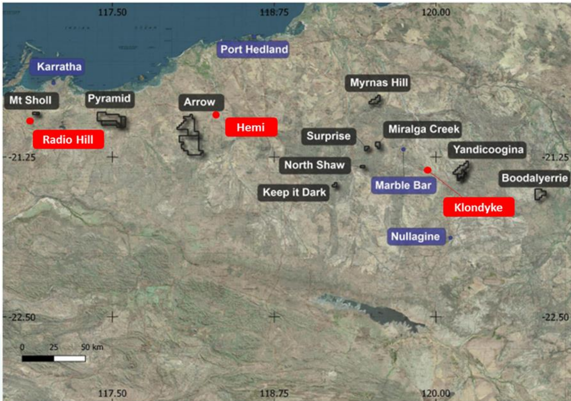
Figure 1: Pilbara property portfolio

Raiden Resources Limited (ASX: RDN) (“Raiden” or “the Company”) is pleased to announce that an airborne magnetic survey has commenced over its flagship Arrow property in the Pilbara region of Western Australia.