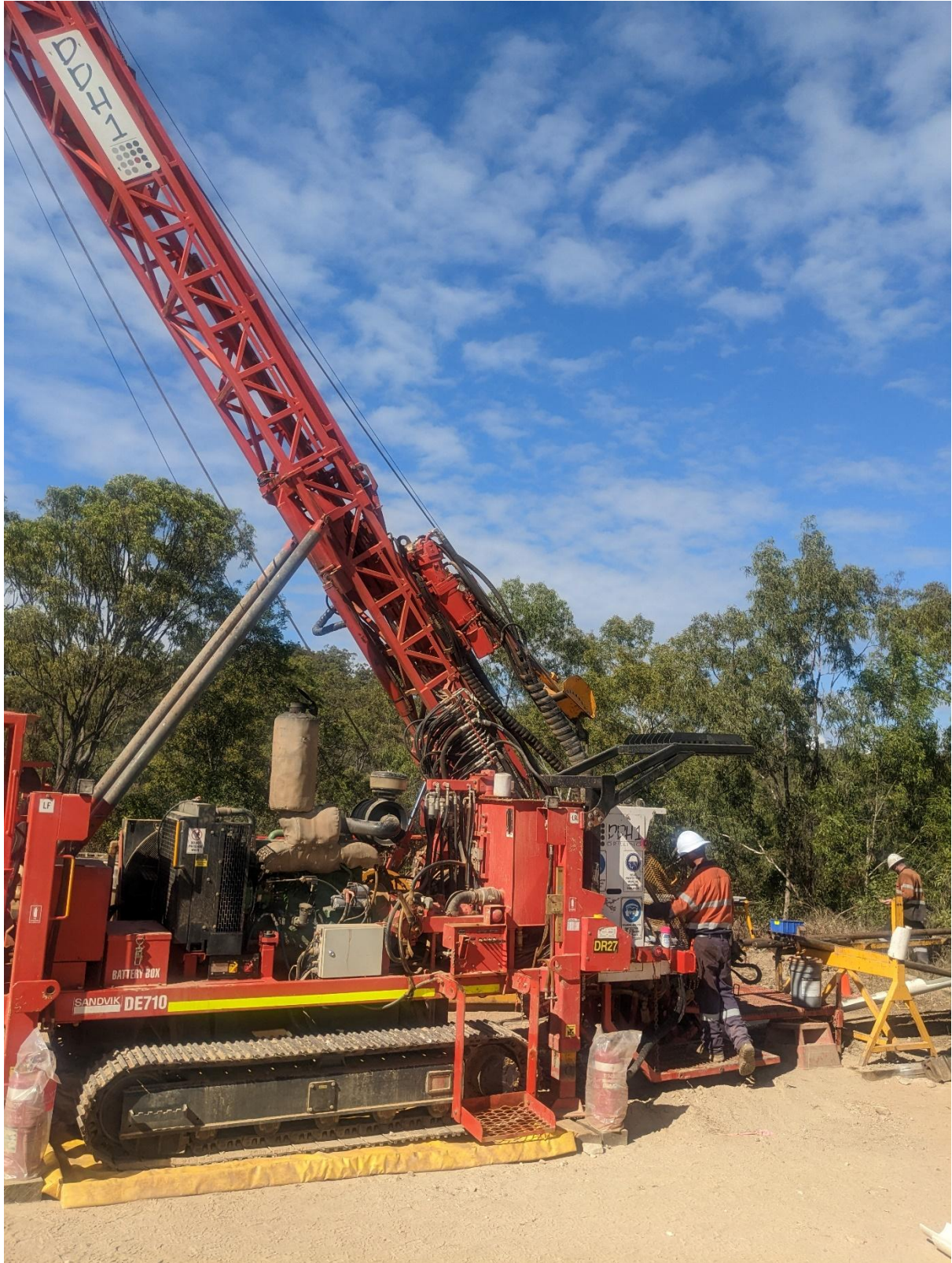
Figure 2: DDH1 Rig 27 mobilised to Dianne with drilling now underway

The results from this drilling will be incorporated into Revolver's geological model and support the Company's ongoing operational planning ahead of the targeted recommencement of copper mining and processing operations at Dianne during H2 2025.