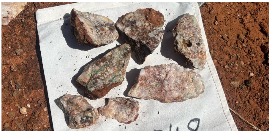
Figure 2: Rock chip samples of vuggy quartz-k-feldspar-carbonate and possible malachite that returned 11.78 g/t Au, 19.5 g/t Ag and 0.18% Cu (SMZS048)

Elevated silver and base metal anomalism associated with standout sample SMZS048 may suggest the presence of a fertile hydrothermal overprint within the broader structurally controlled orogenic gold system, potentially suggestive of proximity to the core of the mineralised system and elevated gold grades.