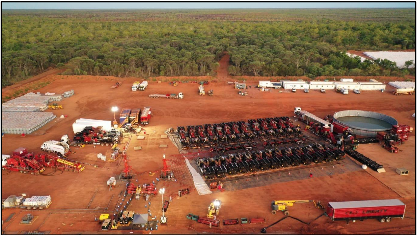
Figure 1: Liberty Energy stimulation equipment and crew preparing to commence operations.