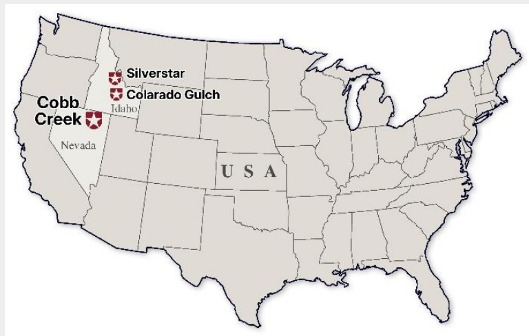
Figure 1-Union Star Metals is positioned in Teir 1 US Jurisdictions