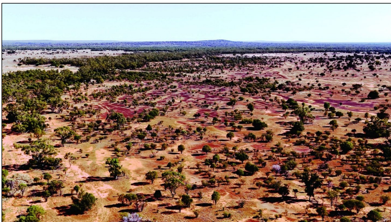
Figure 3: Blind Freddie prospect area showing widespread ferruginous lag derived from outcrop and sub-outcrop, anomalous in copper. Low hill on RHS is Mulga Downs sandstone cover